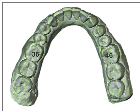
Figure 2: Scanned images superimposed