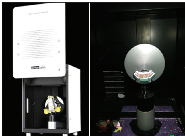
Figure 1: White light scanner (Sagoo, Arti)

Wear was measured using baseline and 12-month interval cast of opposing dentition and 3D scanning and superimposition technique. The enamel wear recorded in